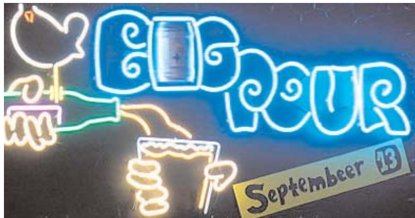
The Big Pour lit up in neon.