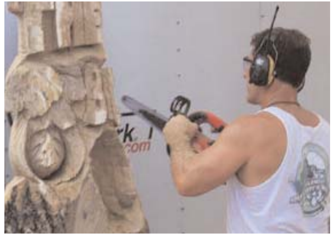
Live art- Chainsaw artists from Sprague Farms.