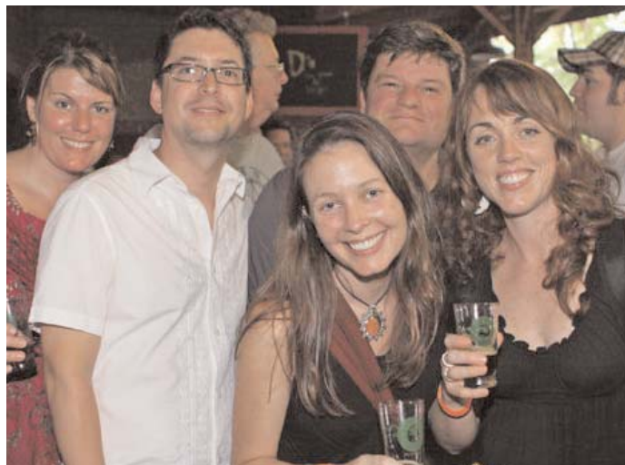
A sampling of “The Big Pour” attendees enjoying the samples.