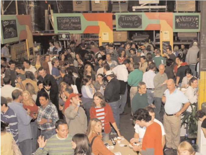
"The Big Pour" session one in full swing.

Construction Junction is seeking sponsors for our annual fundraiser event—The Third Annual Steel City Big Pour—to be held on September 12, 2009. Construction Junction held its first Big Pour in September of 2007. Both of our prior events were extremely successful and we could not have succeeded without the generous support of our event sponsors.