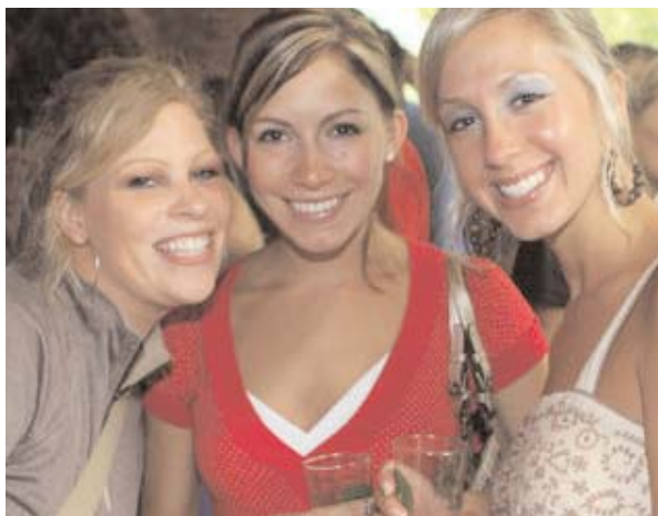
More fans of "The Big Pour".