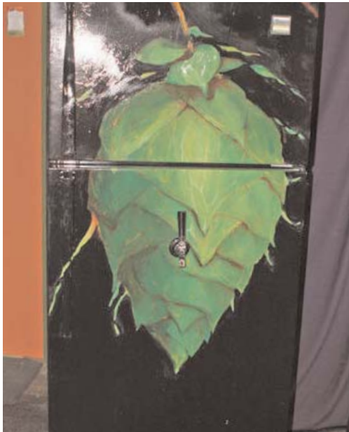
Custom-designed 'Kegeators' in silent auction.