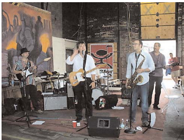
Live music featuring "Hoodoo Drugstore".