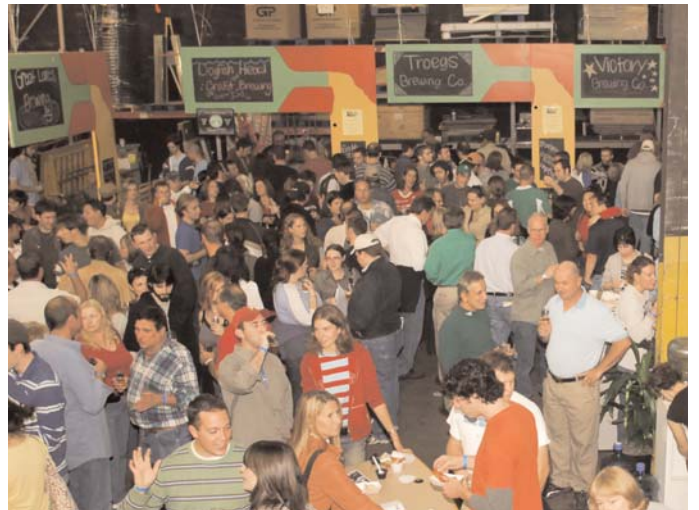
“The Big Pour” session two participants enjoying great food and really great beer.