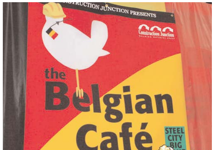
Signage for our popular Belgian feature.